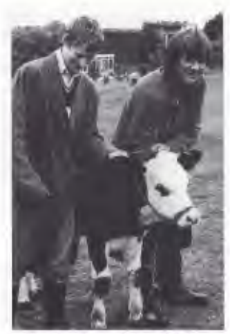
DRS-discretz - end states in the good of stays

The 50th Anniversary Magazine will be available online this year.