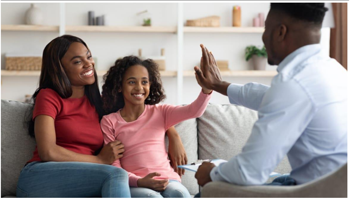
What you'll do

Your job will vary depending on the needs of the family you're working with. Families are known as 'clients' in support work. Difficulties facing your clients could include: