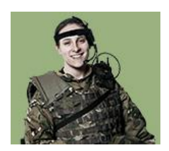
Army Officer Internship

Receive sponsorship university, before joining the Army in a leadership role.