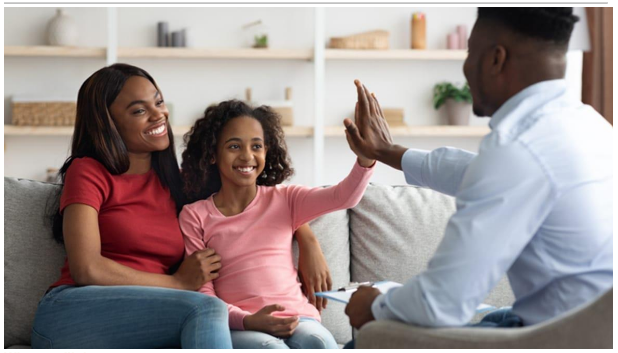
What you'll do

Your job will vary depending on the needs of the family you're working with. Families are known as 'clients' in support work. Difficulties facing your clients could include: