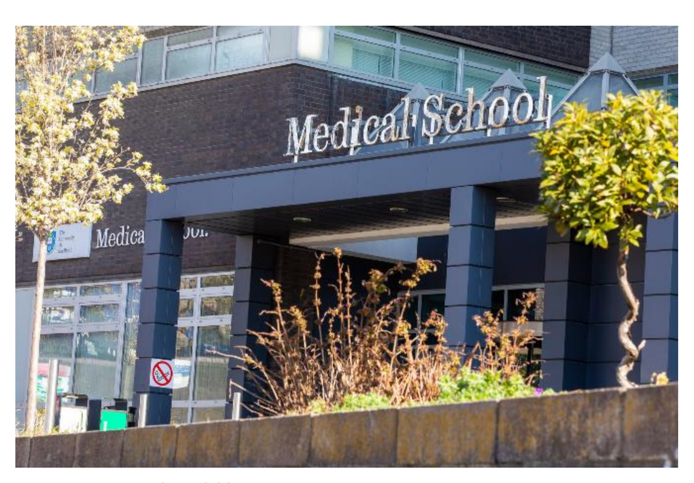
Year 10-13 Academic Activities