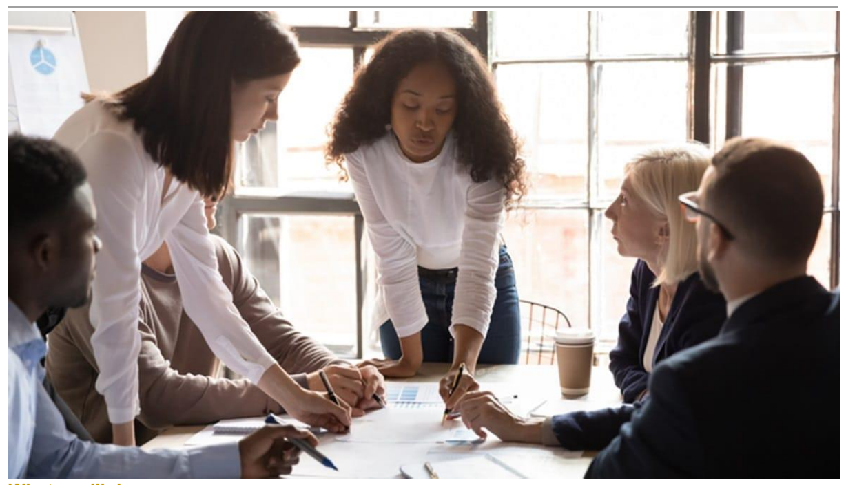
What you'll do

Your main aim is to influence the government or to help others to influence the government. You'll advise your clients on policies and processes, and represent their views to Parliament.